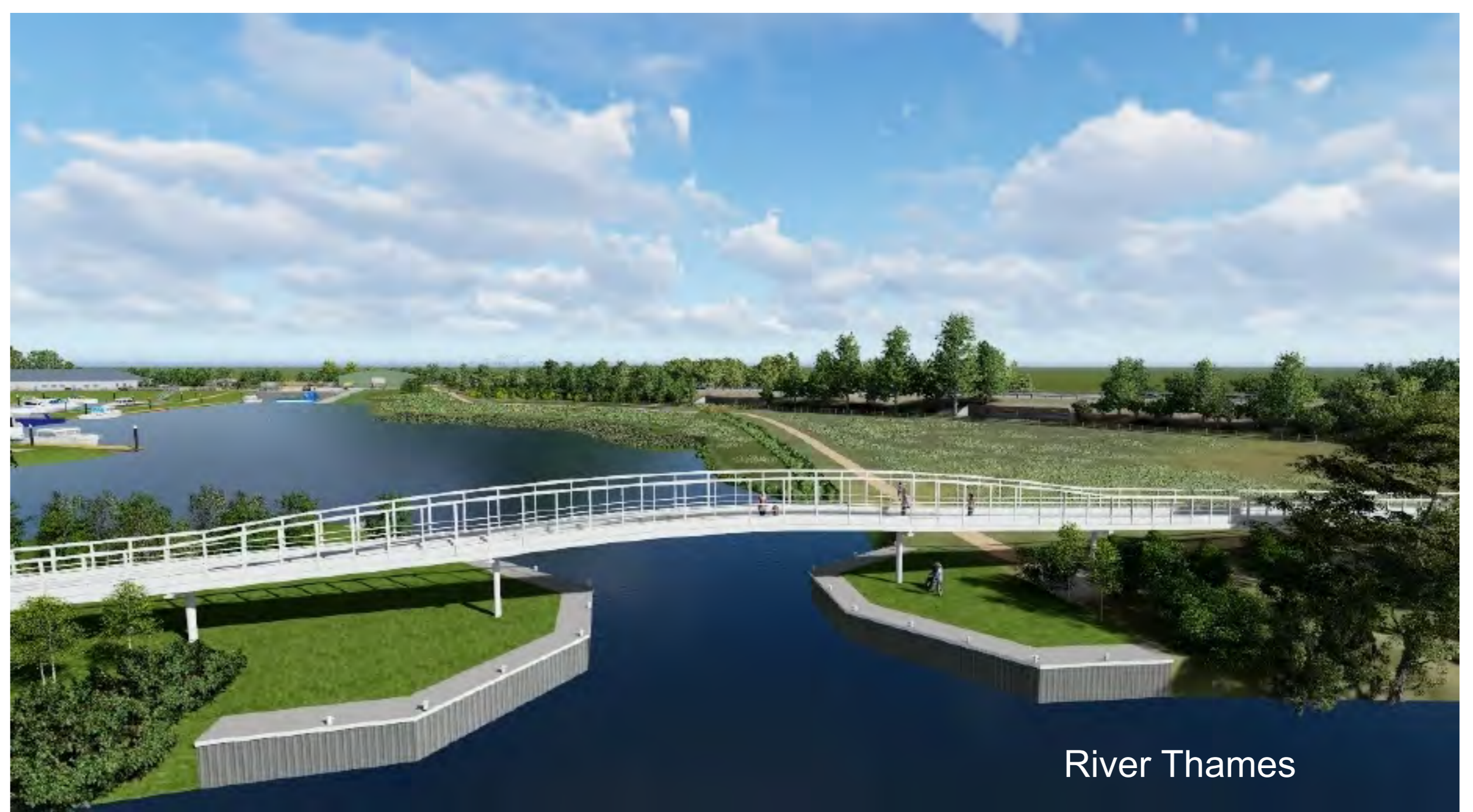
Marina Entrance and Proposed Thames Path Footbridge

The land surrounding bridge will be landscaped and planted to provide a pleasant view.